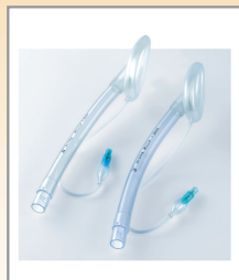
Disposable PVC LMA