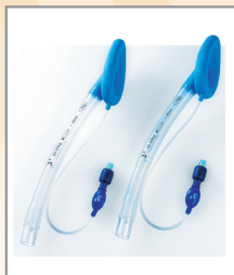
Disposable Silicone LMA